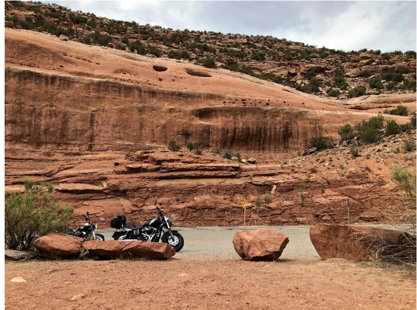
On the road...