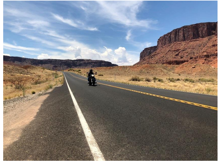
Magnificent scenery of North-East Utah. Let's ride!