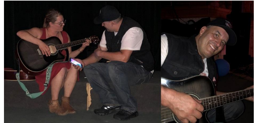
In Norwood, CO we had so much fun in the bar...