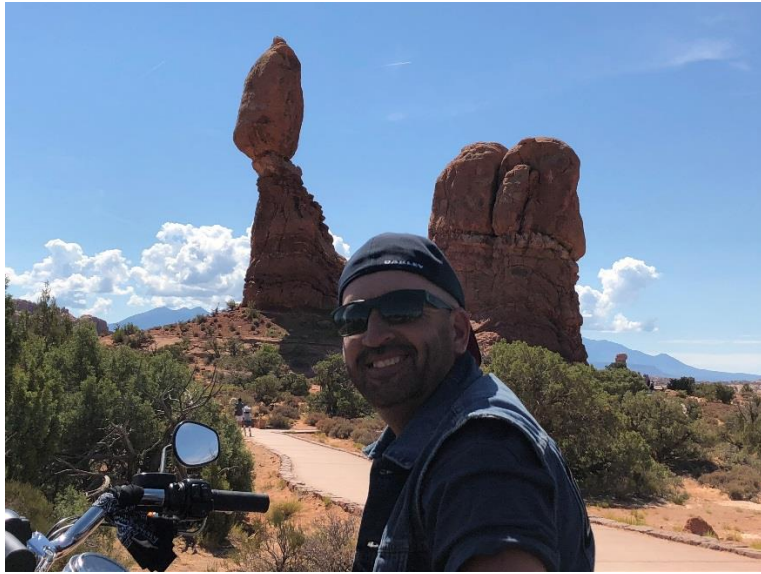
No-helmet ride through Arches National Park, Utah