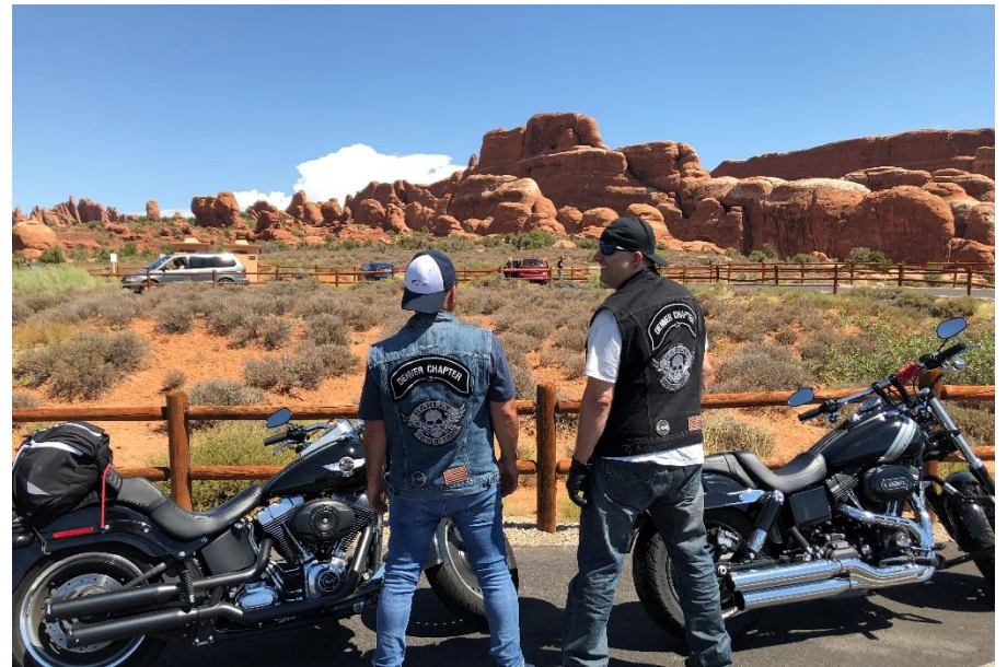
In Arches, the weather was brutal – 112°F