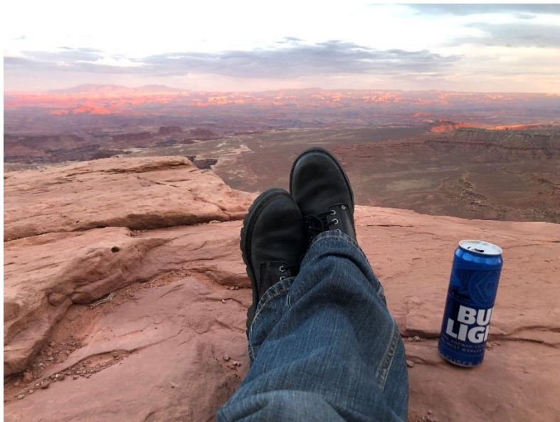
Evening in Canyonlands National Park, Utah